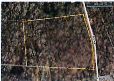
A sketch is unavailable for this parcel.

Muskingum County, Ohio - Property Record Card Parcel: 70-30-01-06-000 Card: 1