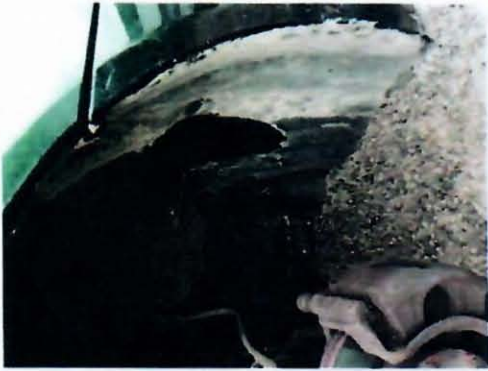
Keith Haddock pictures of vehicle - Claim No. 19-14